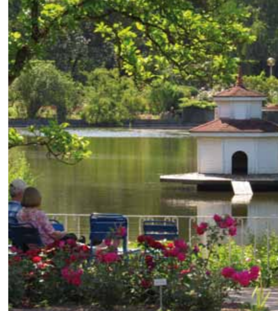
Rose Garden pond