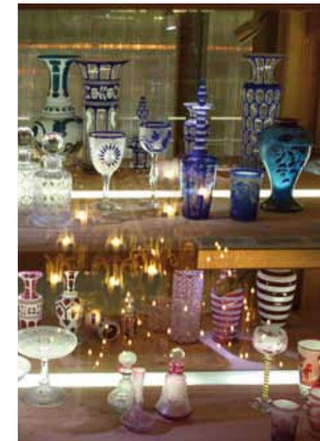
Rock crystal museum in St.-Louis-lès-Bitche