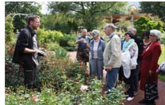
Rose Garden guided tour