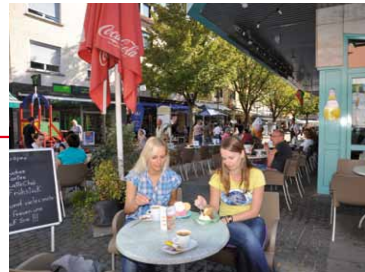
Ice cream parlour in the city centre