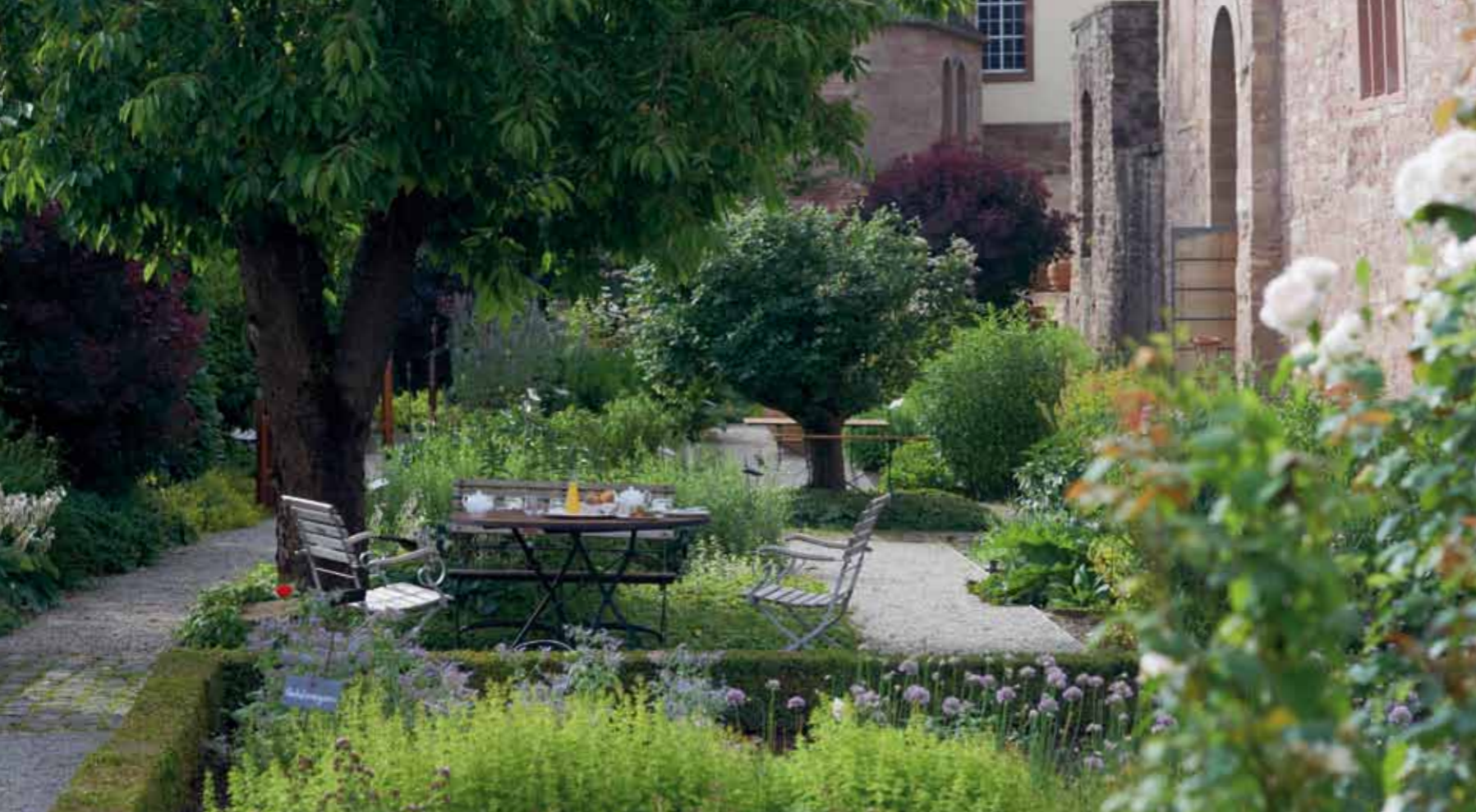
Herb garden of the Hornbach monastery