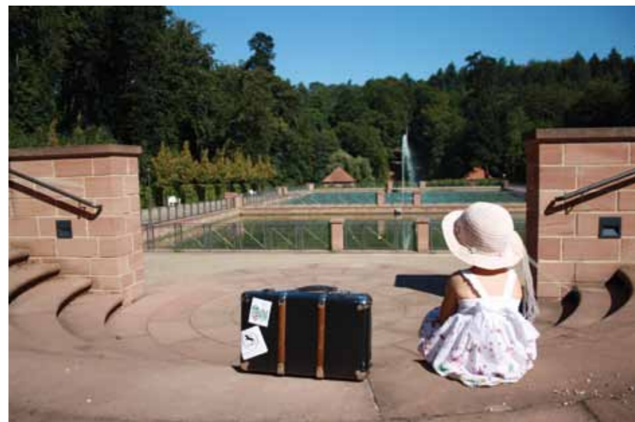
Tschifflick: baroque garden monument