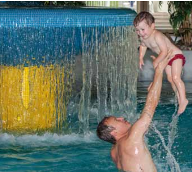
"Badeparadies" indoor swimming pool