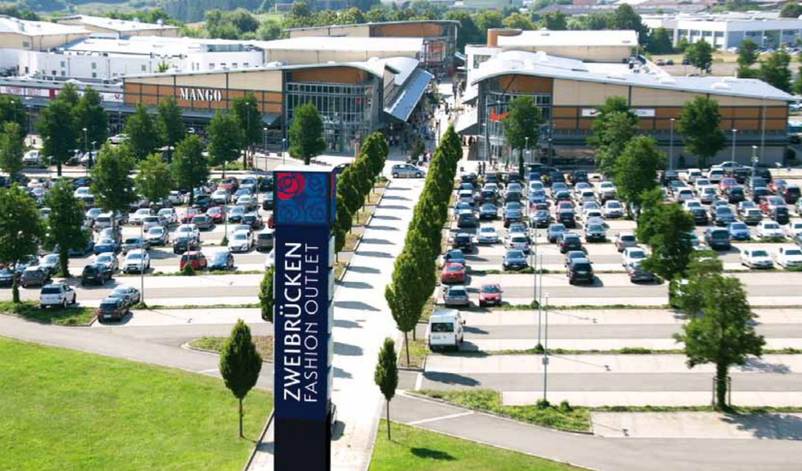
Zweibrücken Fashion Outlet