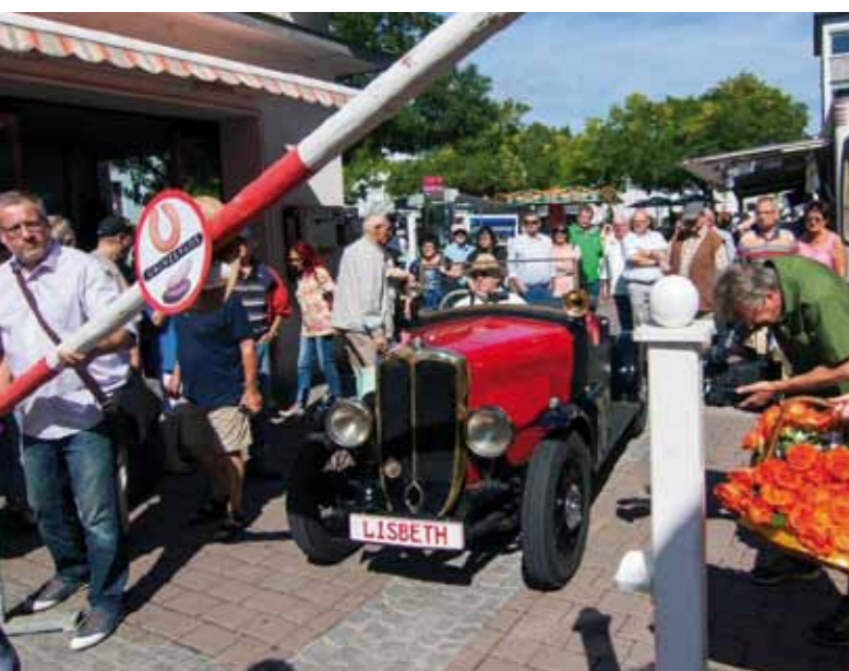
"Saarlanders' Day" in the city centre