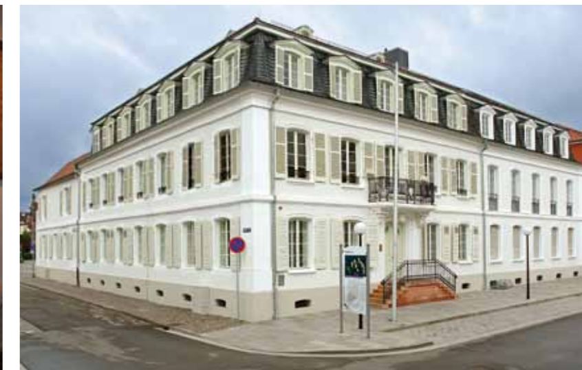
The City Museum in the Petrihaus

The interesting and varied history of the former duke's residence has been researched and passed on by many historians and citizens. Today, dedicated guides are available to help you discover Zweibrücken's history.