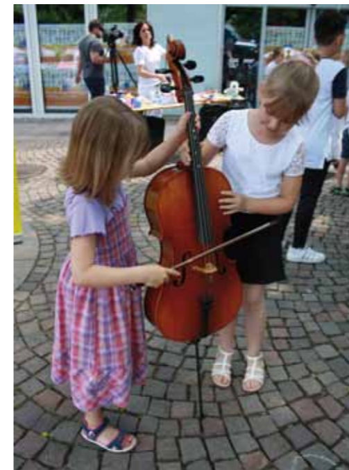
The music school on children's day

"The cherries of Tschifflick": The duke's chambermaid leads through the baroque garden monument in Fasanerie telling the story of Leszczynski's joys and sorrows and the fateful story of his family: lust for life, intrigues, longing and hope – worthy of a film!