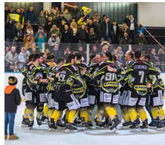
Ice Arena / Ice hockey club EHC Hornets