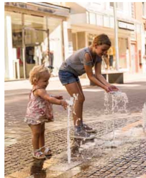
Water games in the pedestrian zone