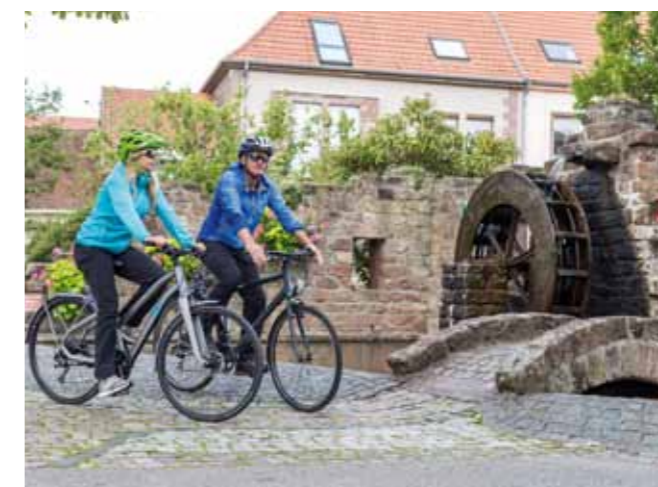
European Mill Cycle Path

Upstream along the Schwarzbach stream, Thaleischweiler with its new water studies trail can be reached. Across the border to France, Bitche and its Citadel and Garden for Peace attract many visitors as well as St.-Louis-lès-Bitche with its Rock Crystal Museum or Meisenthal with its Glass Art Centre.