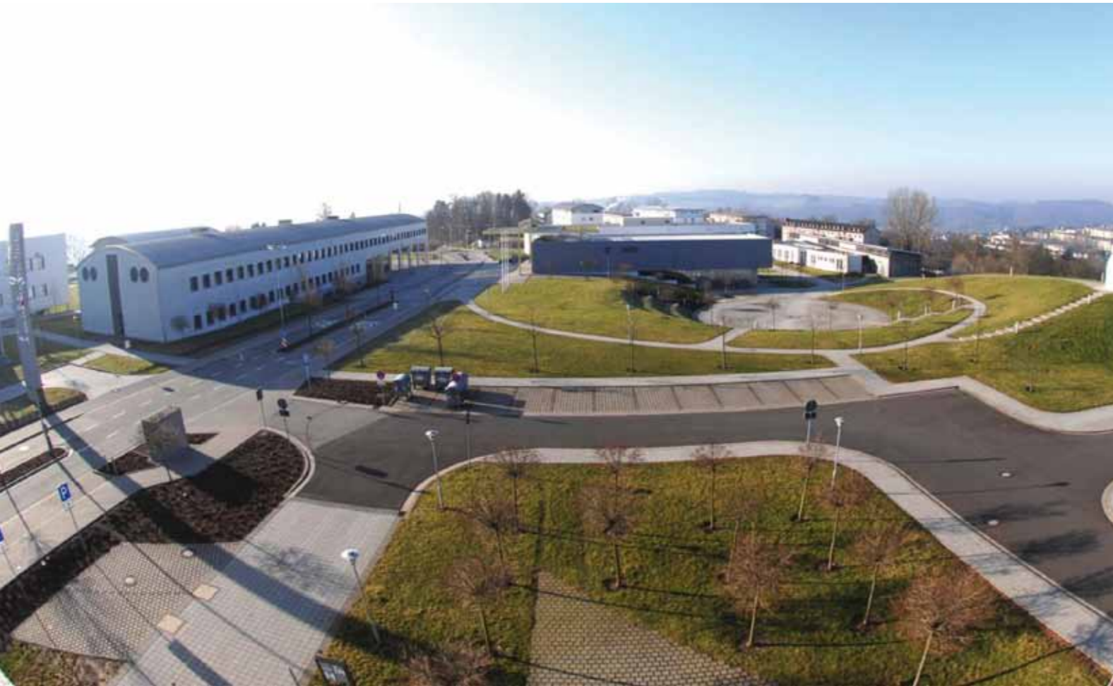
University campus in Zweibrücken