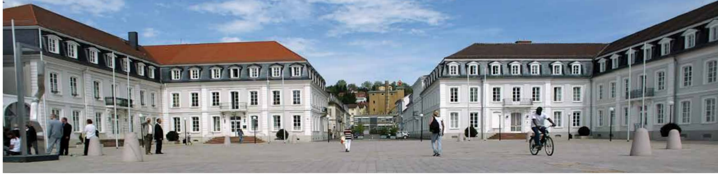
Herzogplatz (Duke Square)

As was quite common in the 18th century, the development of the Herzogplatz was financed by a lottery. Duke officials and communities had to buy a lottery ticket. In addition to cash prizes, the main prizes were the houses on Herzogplatz.