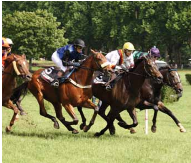
Horse racing on the racecourse