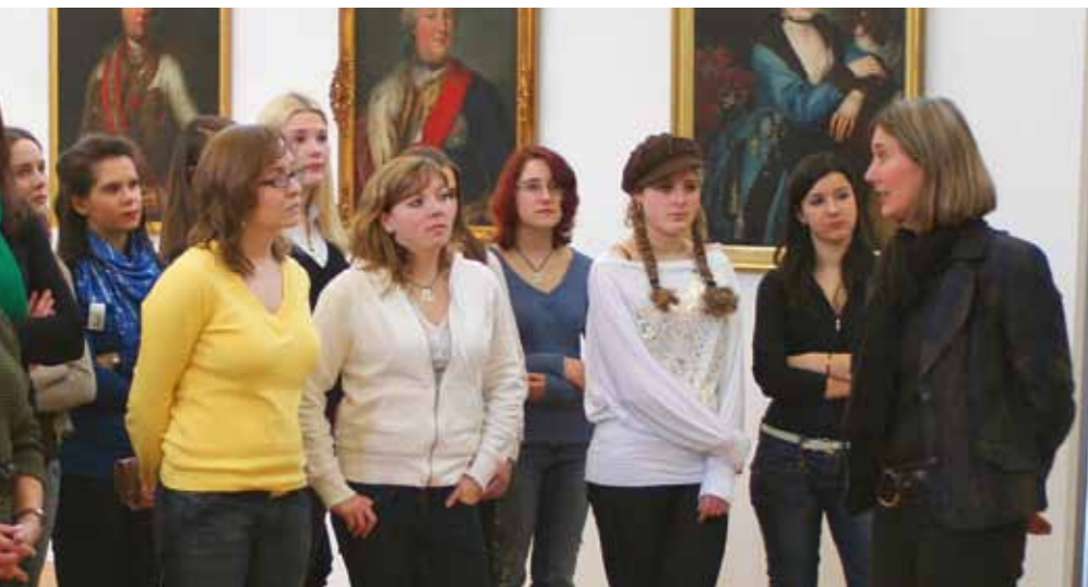
In the City Museum