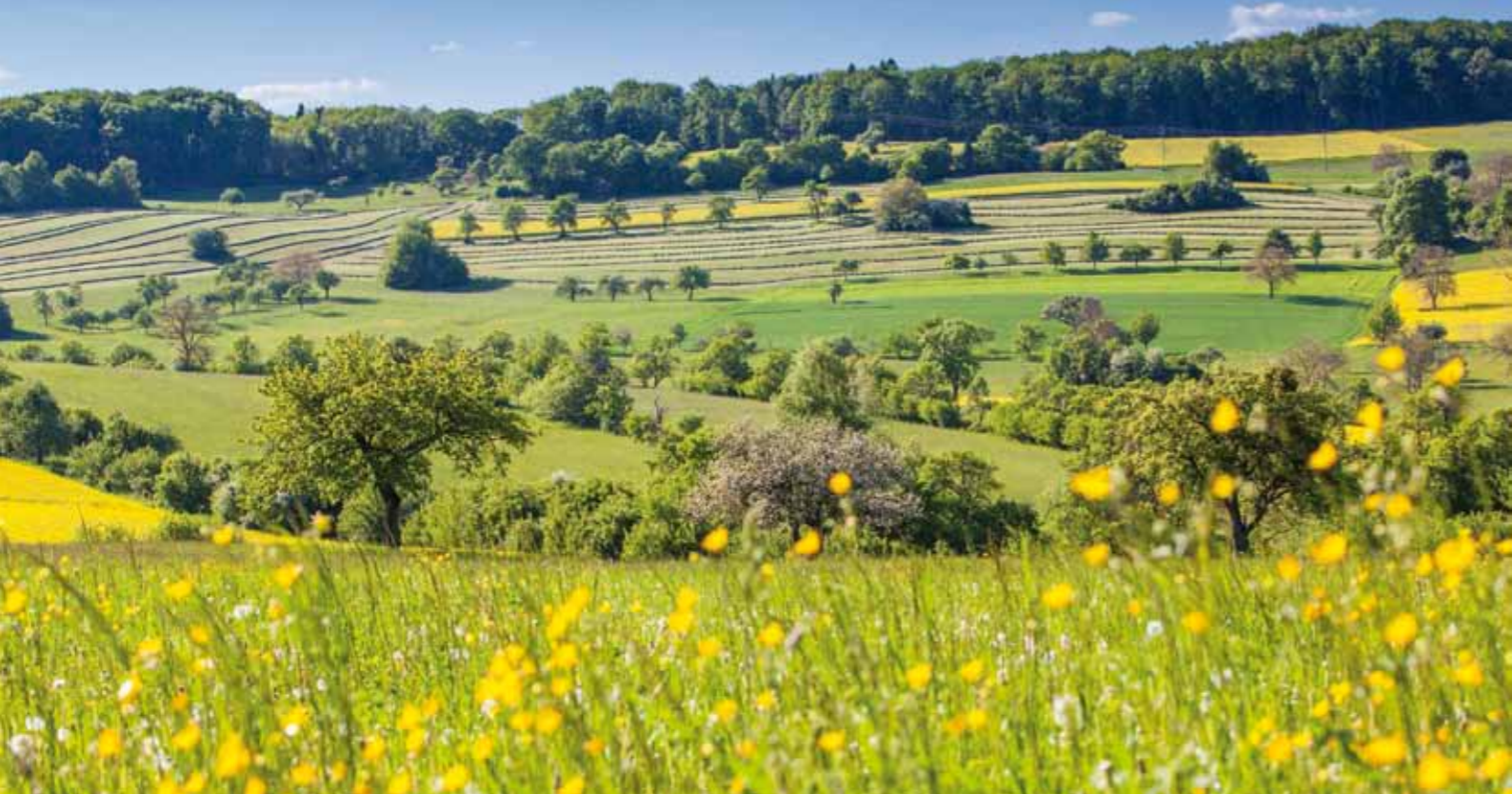
Bliesgau biosphere region