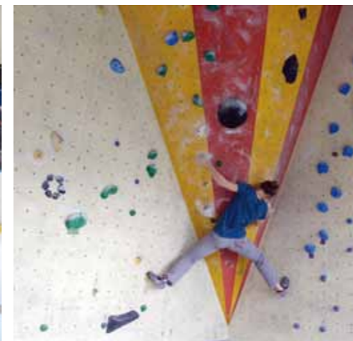
Camp4 climbing hall