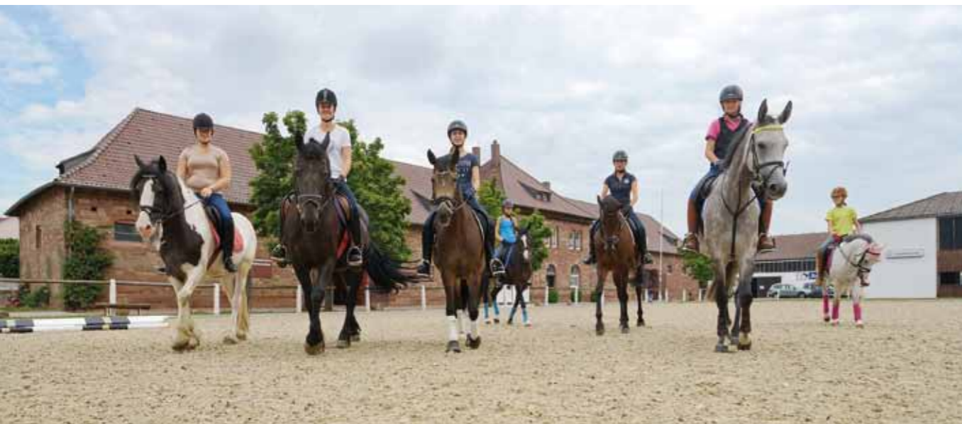
Riding lessons at the Zweibrücken State Stud

Powerful stallions and tender foals. There is some movement at the Zweibrücker Landgestüt (Zweibrücken State Stud): at horse races, carriage rides, riding and vaulting lessons and at the glamorous horse gala.