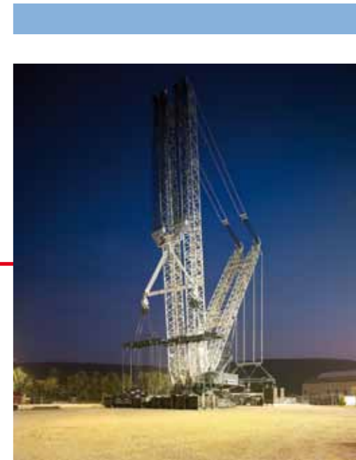
Tadano Demag Germany GmbH

The Zweibrücken university delivers innovations in the information and communication technology, the microsystems technology as well as in the growth sectors of biotechnology and medical technology. www.hs-kl.de