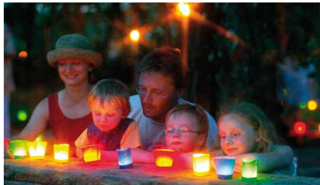
Festival of 1000 Lights

The Rose Garden, a green oasis of 45,000 square metres near the city centre, has been an attraction for guests from all over the world for over 100 years. Roses in more than 1,500 different species and varieties present themselves in a stylish and well-kept environment of groves, flowers and ponds. In the Garden, you will find a large event stage, some theme gardens, a small rose museum and the Dornröschen café. Besides the Wild Rose Garden, the Rücker Garden and the baroque garden monument, the Rose Garden is one of the stops during the Zweibrücken Garden Tour.