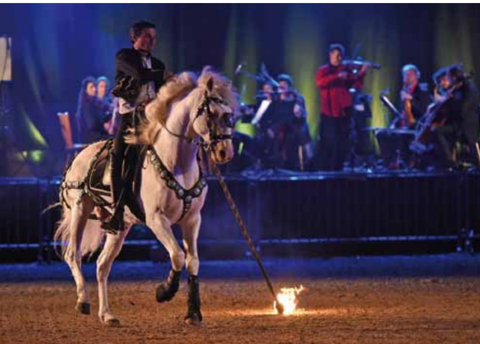
Classical Horse Gala at the Zweibrücken State Stud