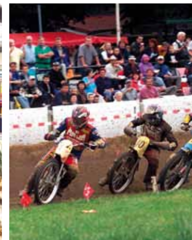
Grass track race