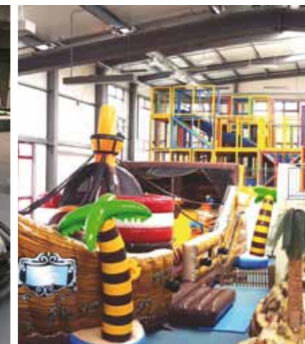
World of Fun