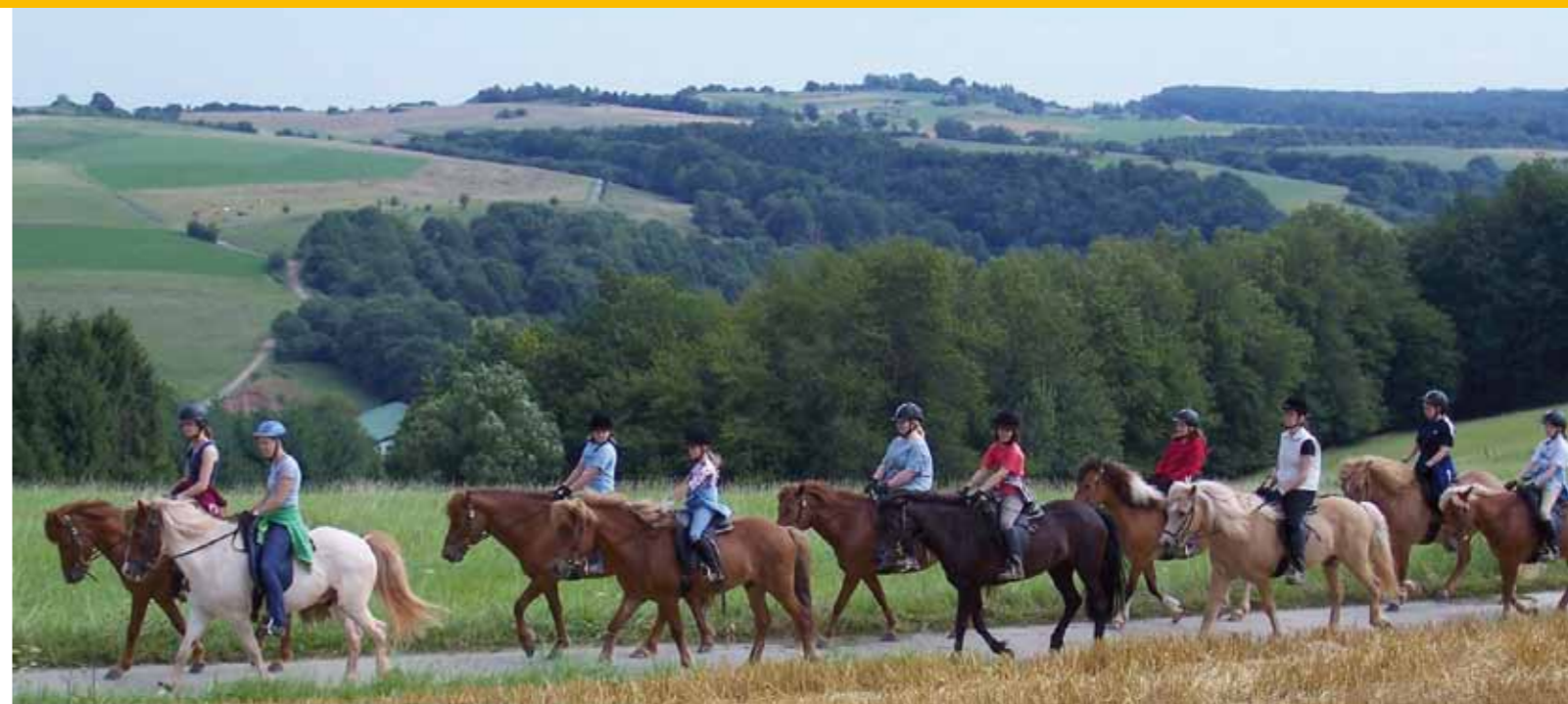
Saga riding school in the Felsalb valley