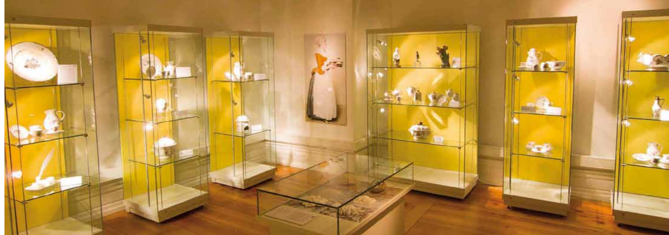
Zweibrücken Porcelain in the City Museum

Guided tours through the town with its baroque tradition and the State Stud as well as through the town museum, through meadows and forests into the Naturpark Pfälzerwald (Palatinate Forest Nature Park) and across the green border to France broaden your horizon. According to your taste, you may do this on foot, in a carriage, on horseback or in a rowing boat. Also, the Bibliotheca Bipontina, the former library of the dukes, can be visited on a guided tour.