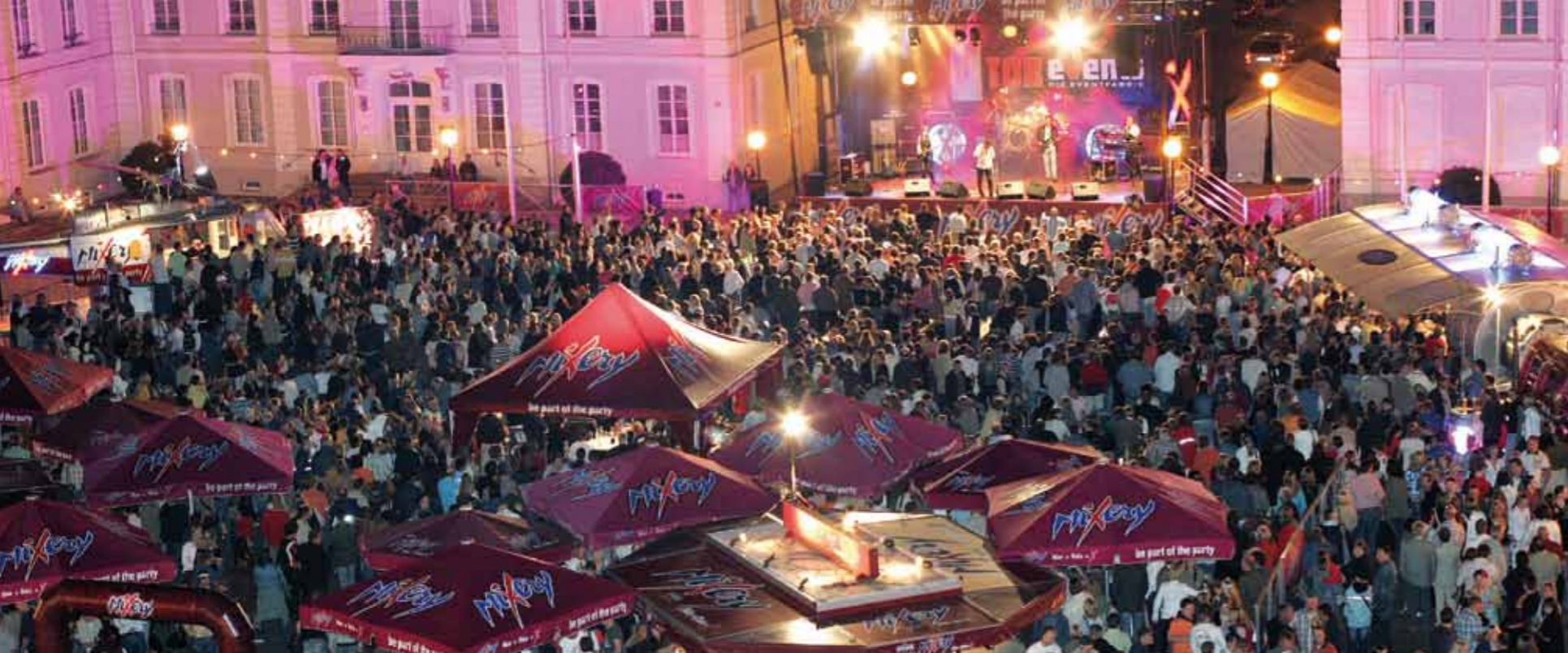
Stadtfest (City festival)

When around 80 artists and bands play a total of 200 hours of music on 9 stages and when more than 150 beverage, food and sales stands leave nothing to be desired then that can only mean one thing in Zweibrücken: It's city festival time!