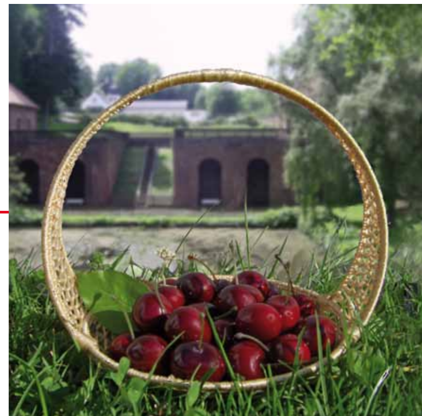
"The cherries of Tschifflick"