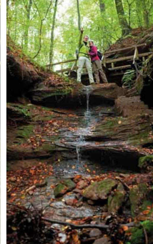
Guldenschlucht (Gulden ravine)