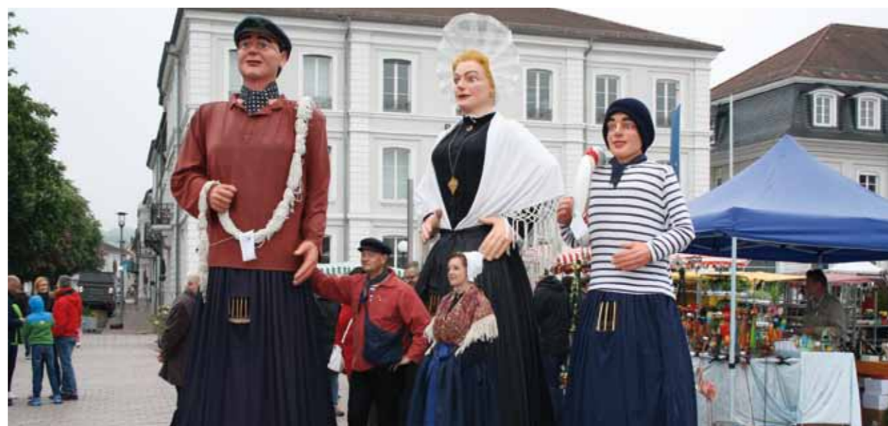
Walking act from Boulogne-sur-Mer