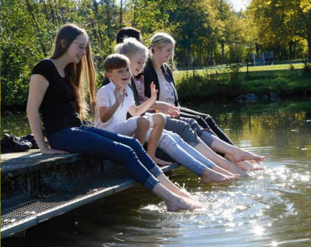
City by the water