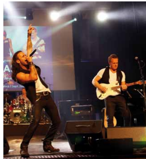
Concert series in the Festhalle