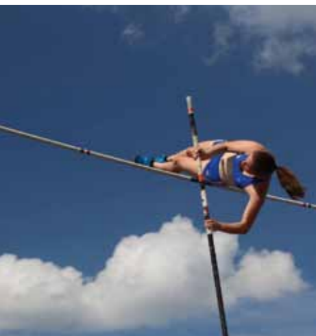
Pole vault in the athletics sports centre LAZ Zweibrücken

Thanks to the many schools, Zweibrücken boasts one of the highest concentrations of sports badges in the whole of Rhineland-Palatinate.