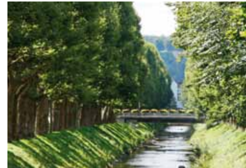
Alley along the Schwarzbach stream