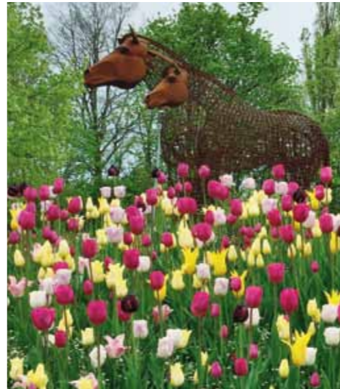
Greenery in the city