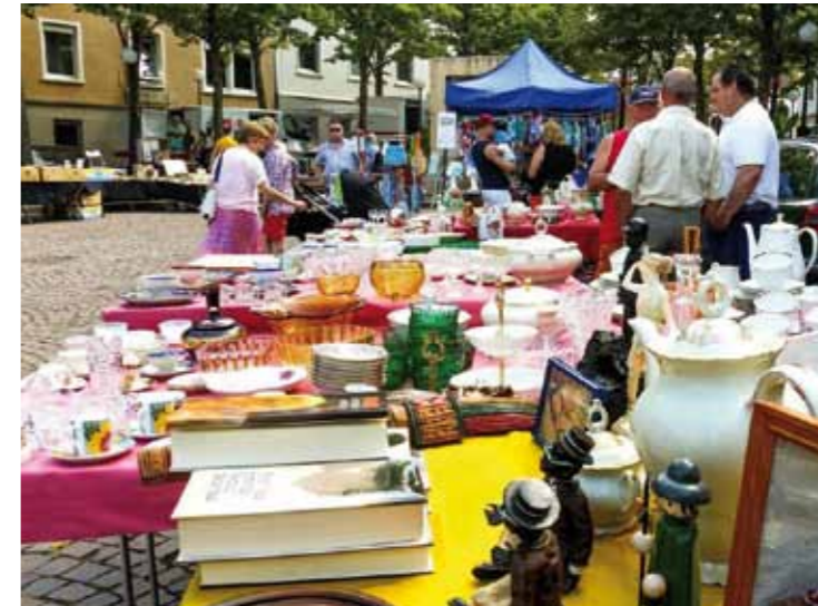
Flea market on Schlossplatz

www.gemeinsamhandel-zw.de www.zweibrueckenfashionoutlet.com