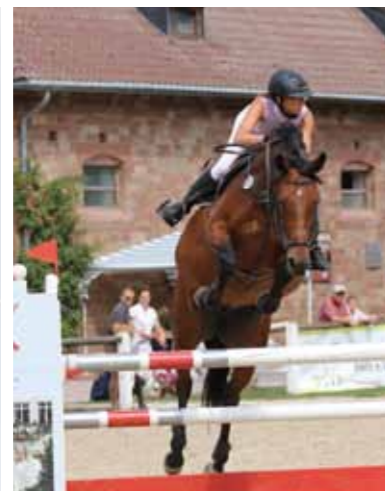
Jumping tournament at the State Stud