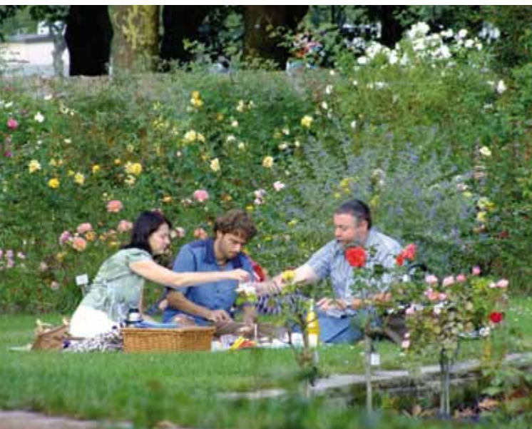
Picnic in the park

Concerts, picnic in the park, the Rose Days, garden markets, seminars and guided tours – the Zweibrücken Rose Garden offers a varied range of events. On the occasion of the Festival of 1000 Lights the whole garden is illuminated by candlelight.