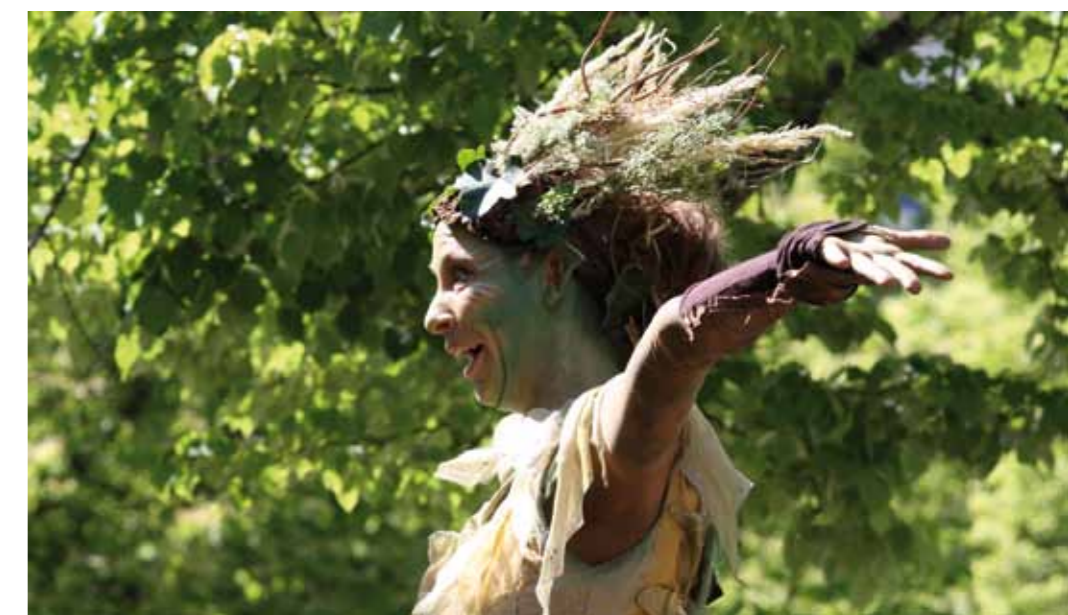
Street theatre event