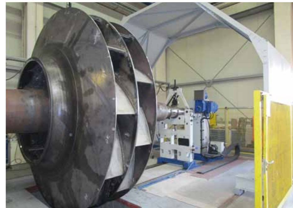
Radial flow fan, TLT-Turbo

Above all, companies in the mechanical engineering and steel and metal processing fields are typical for Zweibrücken. But also the German Armed Forces, the Palatinate Higher Regional Court located in the ducal castle, numerous schools and service providers offer education and employment opportunities for the population of the entire region. www.zweibruecken.de/wifoe