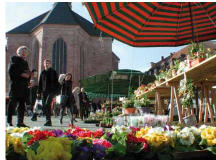
Weekly farmer's market on Alexanderplatz